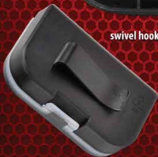
swivel hook for belt